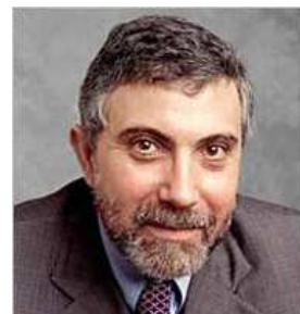
Paul Krugman

Should we use taxes to deter financial speculation? Yes, say top British officials, who oversee the City of London, one of the world's two great banking centers. Other European governments agree — and they're right.